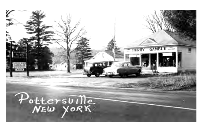
Gamble's Hardware Store - late 1960's