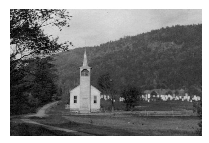
Darrowsville Church and Cemetery Underground Railroad Historic Site

The Society will provide for the preservation of such material and for its accessibility.