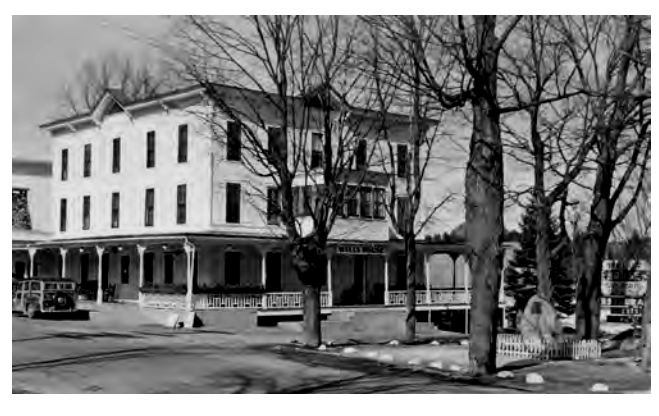
Wells House in Pottersville