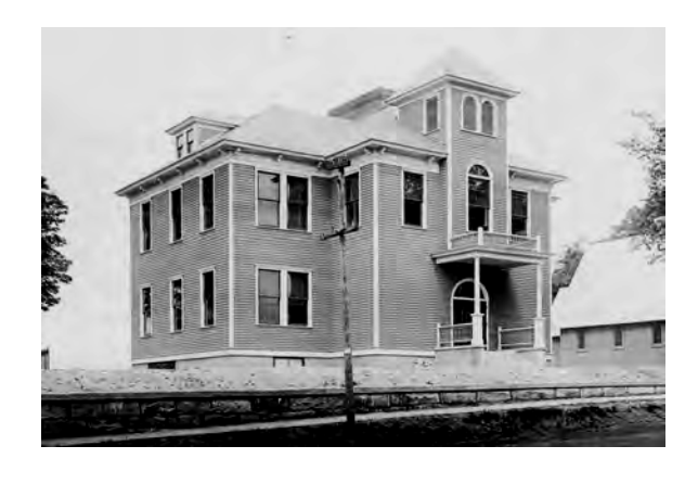
High School in Chestertown - circa 1914