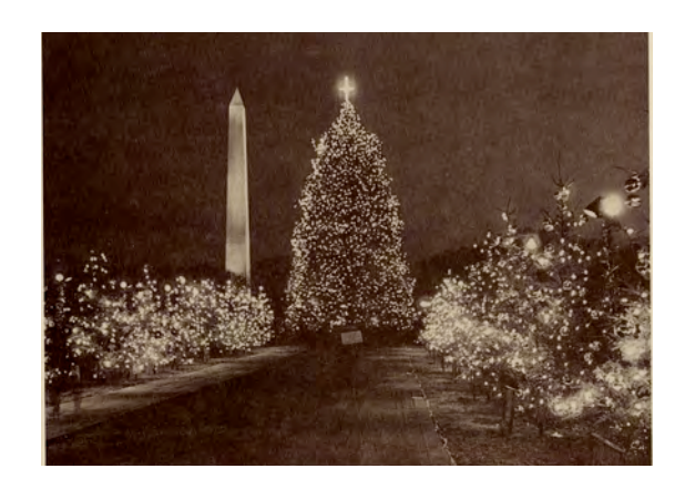
Our Nation's Christmas Tree Washington D.C. – 1964 Former home – Landon Hill Rd., Chestertown