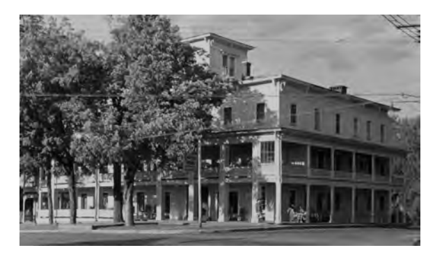
The Chester House – 1941 Formerly on the corner of Main Street & Thieriot Avenue, Chestertown

Town of Chester's Long-time Photographer